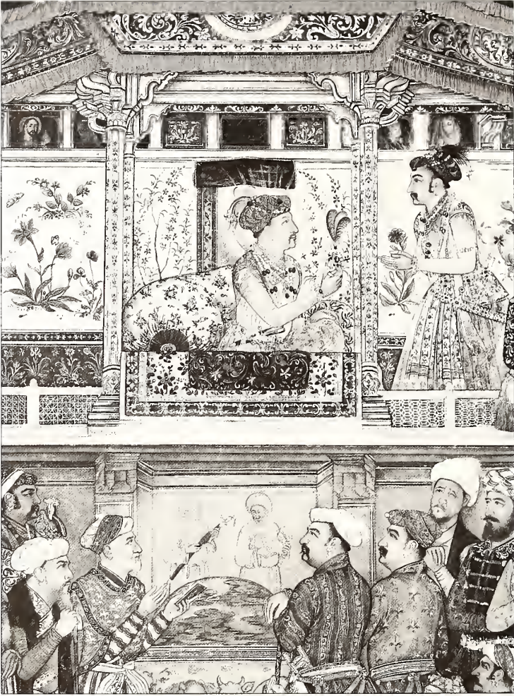
Figure 1. Detail. Jahangir Presents Prince Khurram with a Turban Ornament , by Payag (act. 1598–ca. 1640). India, Mughal period, Shah Jahan period, ca. 1640. Opaque watercolor and gold on paper, 30.6 x 20.3. Royal Collection, Her Majesty Queen Elizabeth II. Religious imagery in a European style adorns the frieze at top.